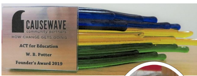
ABOVE: The prestigious 2019 CAUSEWAVE (Former Ad Council) W.B. Potter Founder's Award which was presented to ACT for Education in recognition of its success in bringing a results-oriented initiative that filled a community need.